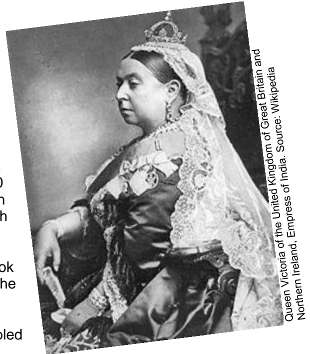
Queen Victoria of the United Kingdom of Great Britain and Northern Ireland, Empress of India.