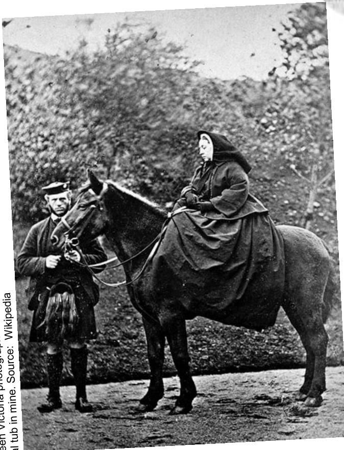
Queen Victoria photographed with Mr Brown in 1863 Girl pulling a coal tub in mine.

17. After her husband's death, Queen Victoria had a servant from Scotland named John Brown. Rumours of a secret relationship and marriage soon appeared in public. The Queen was sometimes referred to as "Mrs Brown".