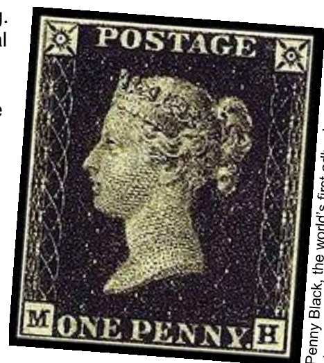
Penny Black, the world's first adhesive postage stamp.