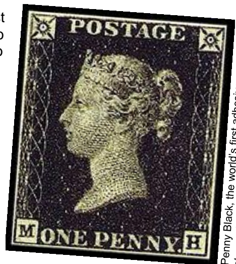
Penny Black, the world's first adhesive postage stamp.