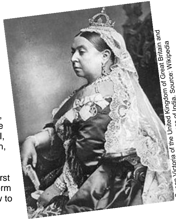
Queen Victoria of the United Kingdom of Great Britain and Northern Ireland, Empress of India.